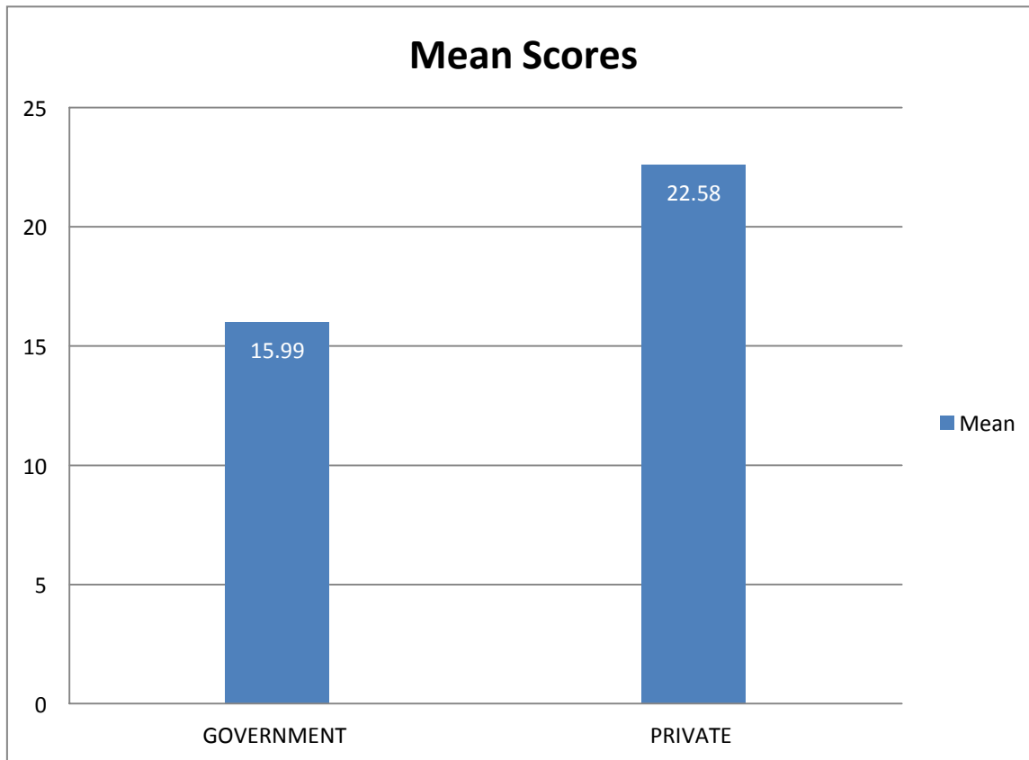
Figure 1.4 Graphical representations of Mean Scores of Government and Private Girls Schools on Overall Adjustment dimension of the Adjustment Scale.